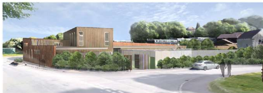
View From Arne Avenue

A: We have worked with our architects and quantity surveyors and estimate that it will cost £2.2 million pounds to build.