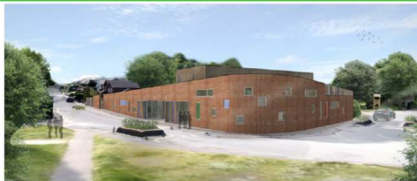
From Aspen Road Looking Up Northmore Road